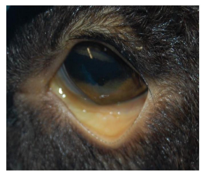
Figure 5 – Jaundice in a neonatal lamb with autoimmune haemolytic anaemia

Weak lambs and inappetant ewes with poor milk supply resulted in the use of artificial colostrum in some cases. Postmortem examination findings of jaundice (Fig 5) and red urine suggested a diagnosis of haemolytic anaemia and histopathology of bone marrow, liver and spleen detected extensive evidence of erythrophagocytosis by macrophages. The colostrum product was marketed as suitable for lambs but did contain bovine colostrum. Antisheep red blood cell antibodies may be present in bovine colostrum and are a known cause of immune mediated haemolytic anaemia in neonatal lambs. Other possible aetiologies include administration of medications including antibiotics, but it may also be primary and idiopathic. It was not possible to definitively prove the cause in this case, but further investigation of the weak lamb/poor ewe milk supply issue was advised.