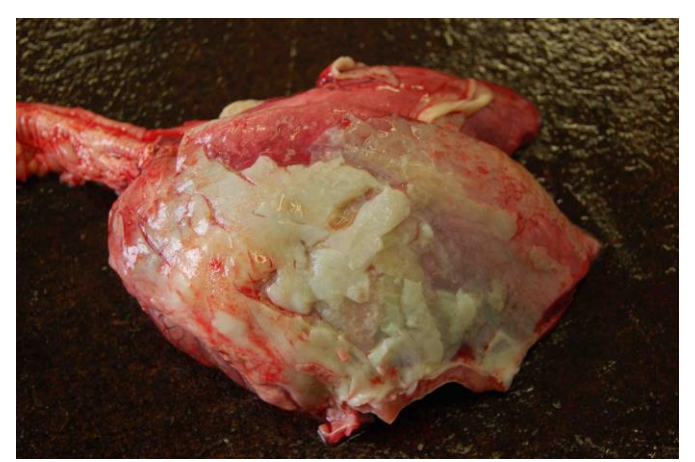
Figure 3 – Fibrinous pleurisy caused by Mannheimia haemolytica in a lamb

Mannheimia haemolytica was diagnosed as the cause of death in four to six-week-old lambs in two south-west flocks. In both cases the lambs were still housed, and the death of 1 of 45 and 2 of 13 lambs was reported. Ewes had received a clostridial/pasteurella booster vaccination prior to lambing but no vaccines had been administered to the lambs yet. Postmortem examination found fibrinous pleurisy in both cases (Fig 3) with additional lung consolidation in one. Mannheimia haemolytica pneumonia or septicaemia was reported from all areas of Scotland during March and is associated with the immunity gap that occurs following waning of short lived colostral antibody protection in lambs that are yet to receive a primary course of vaccine.