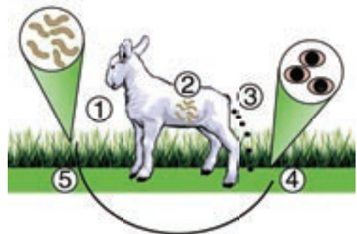
Fig 1: Life Cycle of the Common Abomasal and Gutworms of Sheep.