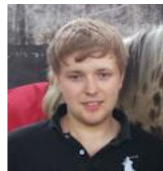
✗ Wrong dimensions