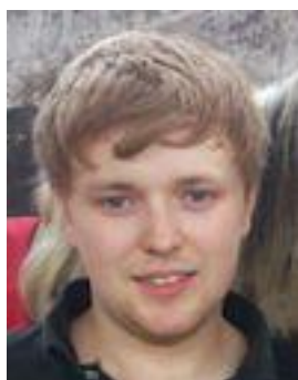
✓ Image acceptable