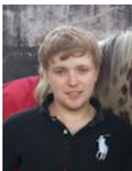
✗ Face too small within image