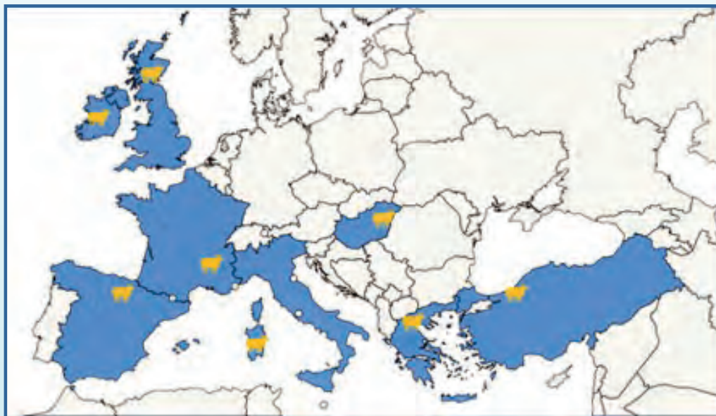
Map of the EuroSheep countries

The project relies on efficient regular discussion and knowledge exchanges between the different levels of the network, within and between each country involved. Regular workshops are organised, nationally first to gather knowledge or feedback from each participating country, followed by transnational workshops where farmers, advisors and researchers all meet and share information from their own countries.