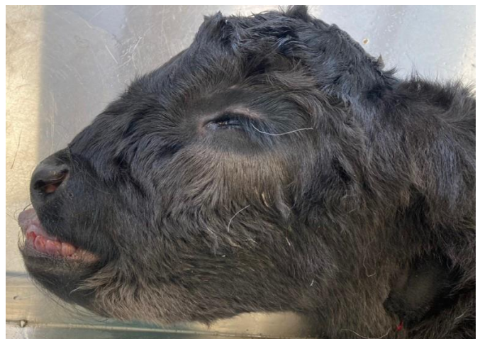
Figure 1 – Brachygnathia superior in a belted Galloway calf with congenital alpha-mannosidosis

Congenital alpha-mannosidosis was diagnosed in six belted Galloway calves born in a herd of 31 cows. A range of malformations were observed including brachygnathia superior (Fig 1), doming of the head, arthrogryposis, ascites and internal hydrocephalus.