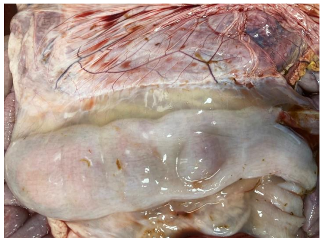
Figure 3 – Mesocolon oedema secondary to suspected adenovirus infection

A six-month-old salers calf died within an hour of being found recumbent and was submitted for postmortem examination. It was the only death from a group of 50 weaned calves at grass with access to hay and a barley blend. The abomasum was diffusely reddened and moderately thickened, with petechial haemorrhages on the mucosa. The large intestinal content was very watery with reddening of the mucosa, a few small punctuate ulcers in the colon, and prominent mesocolon oedema (Fig 3). Histopathology revealed frequent intranuclear viral inclusion bodies within the endothelia of blood vessels in the mucosa and submucosa of the abomasum, small and large intestines. Damage to the endothelia explained the mesocolon oedema, and the presence of inclusion bodies suggested infection with bovine adenovirus. A confirmatory test is not readily available, but the findings were similar to those described in cases of adenovirus enteritis in New Zealand cattle. 2 Affected animals are typically pyrexic and diarrhoeic and may die peracutely. Bovine adenoviruses are widespread in the environment but given the low prevalence of disease it is likely that a combination of host and environmental factors are required to allow infection to become established. This calf had evidence of moderate parasitic gastroenteritis and mild coccidiosis, both of which may have predisposed to adenoviral infection but are not uncommon findings in young cattle.