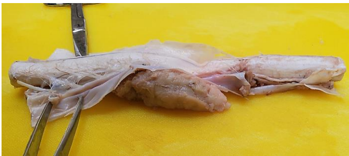
Figure 4 – Spinal neoplasia in a case of sporadic juvenile lymphoma

A video of an 18-month-old Limousin cross male beef finisher was received prior to euthanasia and submission of the carcass. The animal had been recumbent for 24 hours and was bright and responsive but unable to rise due to paresis of all four legs. Postmortem examination detected a pale bulbous Y-shaped mass in the cervical spinal column adjacent to the axis (Fig 4). Further dissection found that it was adherent to the dura mater and causing a focal depression in the spinal cord. Histopathology and immunohistochemistry confirmed that the mass was a lymphoma of T-cell origin and therefore consistent with sporadic juvenile lymphoma. Infiltration of the prescapular lymph node by neoplastic cells indicated that it was multicentric. Characterisation of the tumour was important as spinal involvement is well recognised in cases of enzootic bovine leukosis associated with bovine leukaemia virus infection. This notifiable condition is most common in animals over two years-of-age and is a result of B-cell proliferation.