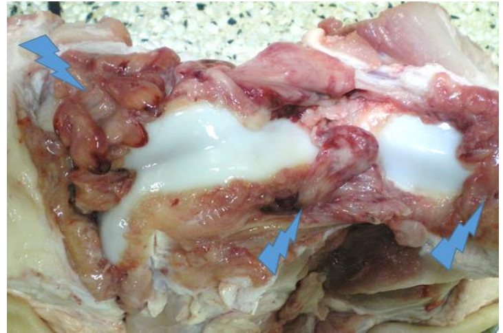
Image 1. This stifle joint from a finished pig was condemned by a meat inspector as it had increased amount of fluid in the joint. When opened up, the synovial membranes inside the joint were very red and proliferated as shown by the arrows. Normally this tissue should be pale and thin. These lesions are chronic and are likely to have taken a number of weeks to develop. After successful treatment for the infection, it can take 6 – 8 weeks for such lesions to resolve and pass muster with meat inspectors. The infection does not affect the joint cartilage which looks perfect in this case.

although defences are mounted, the organisms continue to multiply and keep the upper hand. The result is chronic arthritis that is seen by meat inspectors who condemn the joints (Image 1).