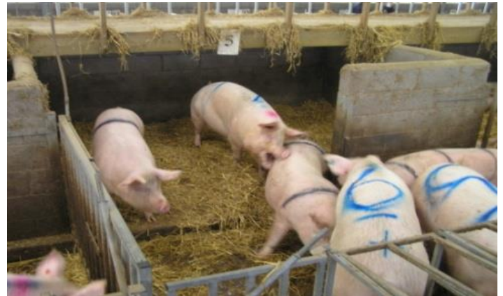
Social mixing can be a major cause of pre-natal stress

Stress responses. Piglets born to stressed mothers showed changes to their brain development and increased stress responses to events in their own life. Such increased stress reactions not only represent an animal welfare issue but may make animals harder to handle and lead to impairments of immune function, leading to higher herd disease levels.