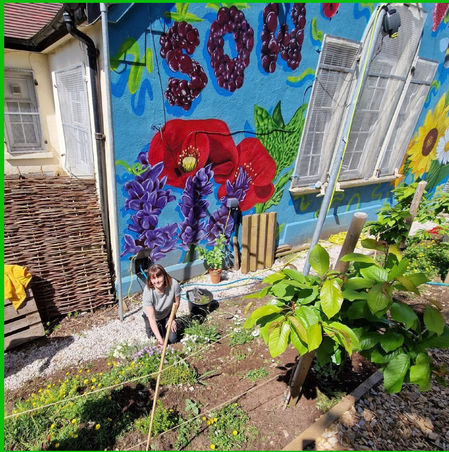
Images from the garden: Fruit trees, a floor mosaic designed and placed by community members and a large, colourful mural on the back wall of the South West Library